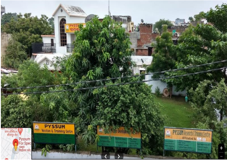
PYSSUM Inclusive Community Living (Preliminary Plan)